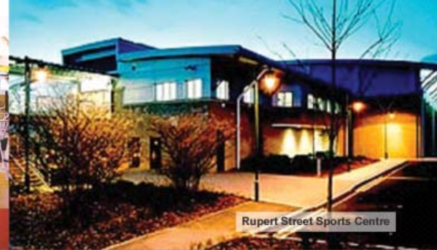
Rupert Street Sports Centre