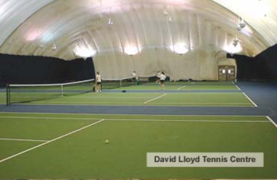
David Lloyd Tennis Centre