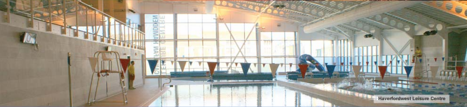
Haverfordwest Leisure Centre